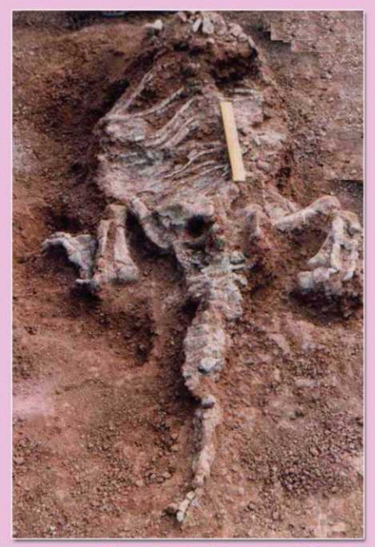
Rhynchosaurus skeleton