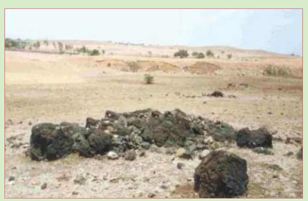
Hardebanke variant of Siddanpalle kimberlite (SK-1), Mahabubnagar District, Telangana