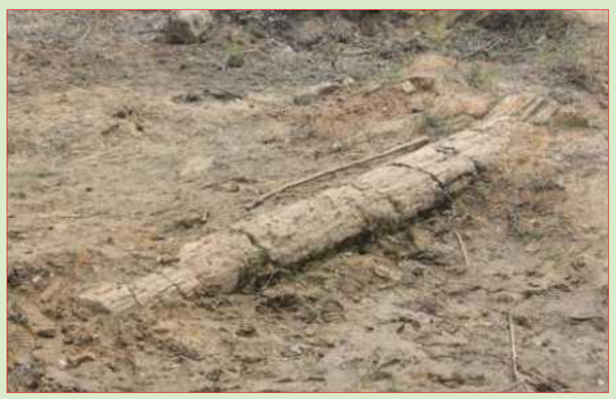
The petrified wood trunk (5m x 13m) located along the Paloncha - Dammapeta Road, Khammam District, Telangana State.