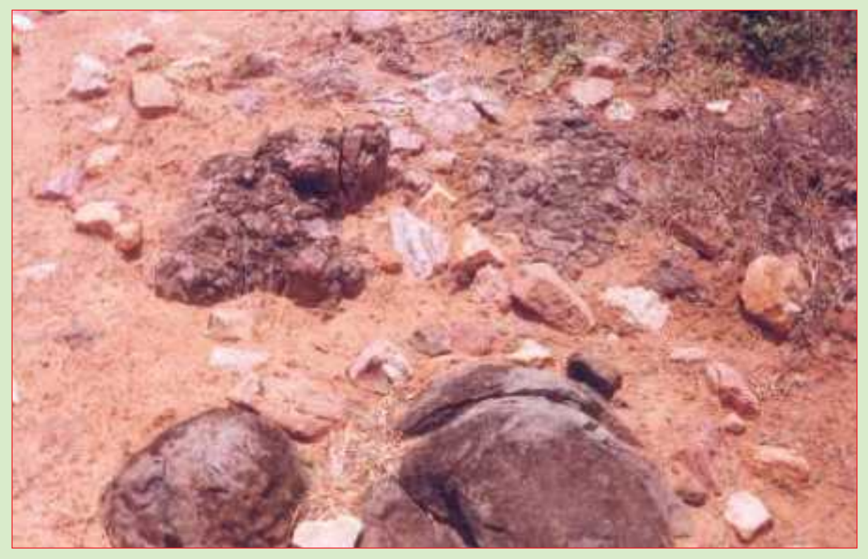
Field photograph of Ramadugu Lamproites, Nalgonda District, Telangana