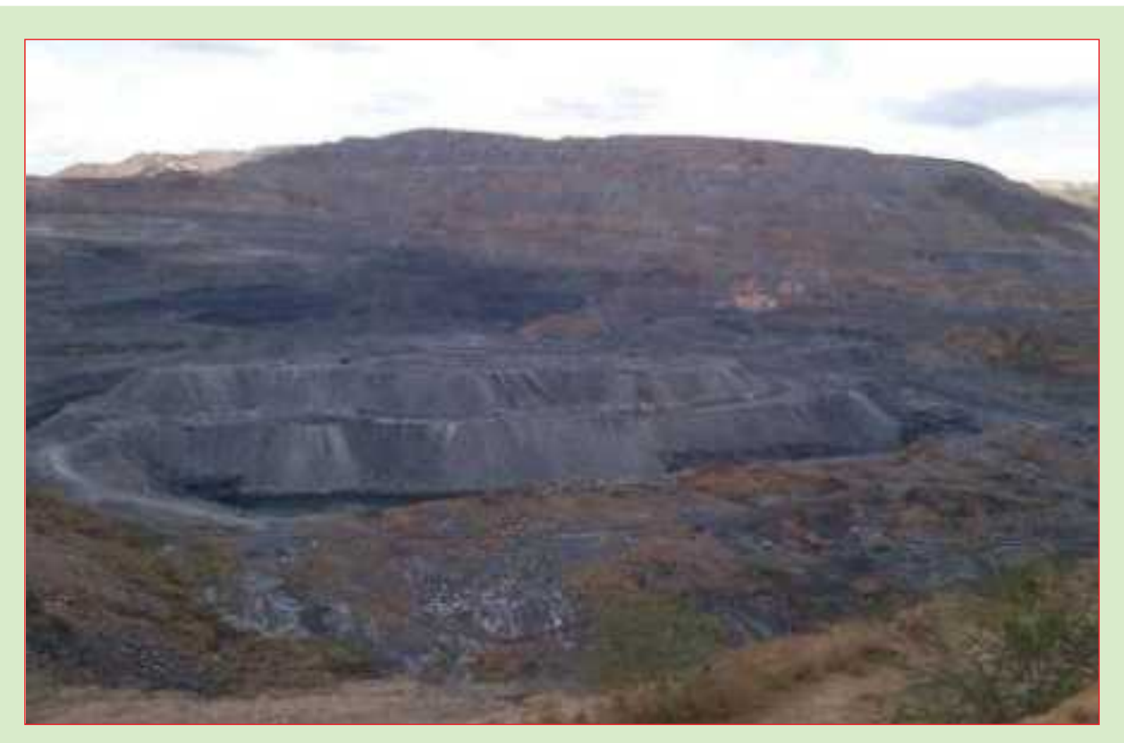
Kondapuram open cast coal mines, Khammam district, Telangana