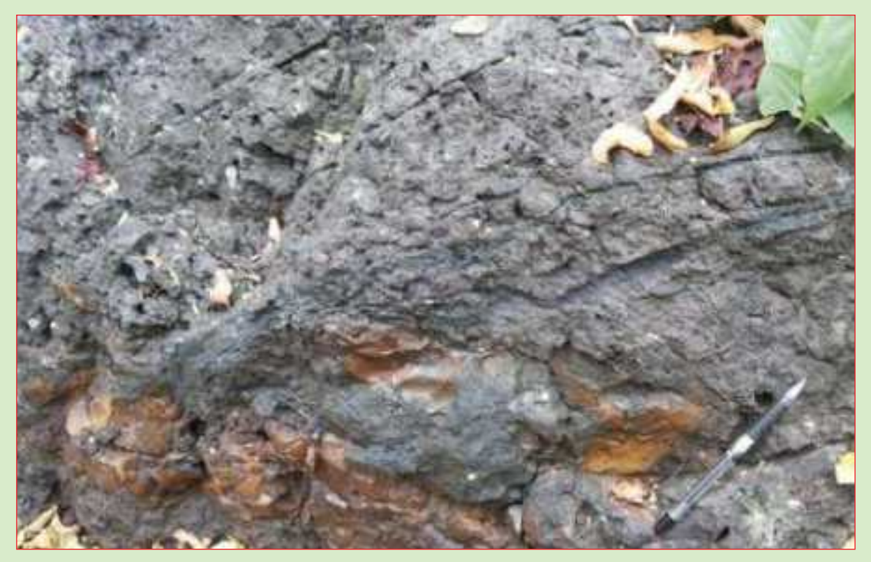
Iron ore, South of Nilavancha, 65C/2, Bayyaram,Warangal district, Telangana