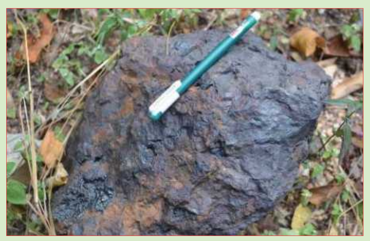
Haematite, Bayyrarm Iron ore belt, west of Motlatimmapuram, Khammam district, Telangana