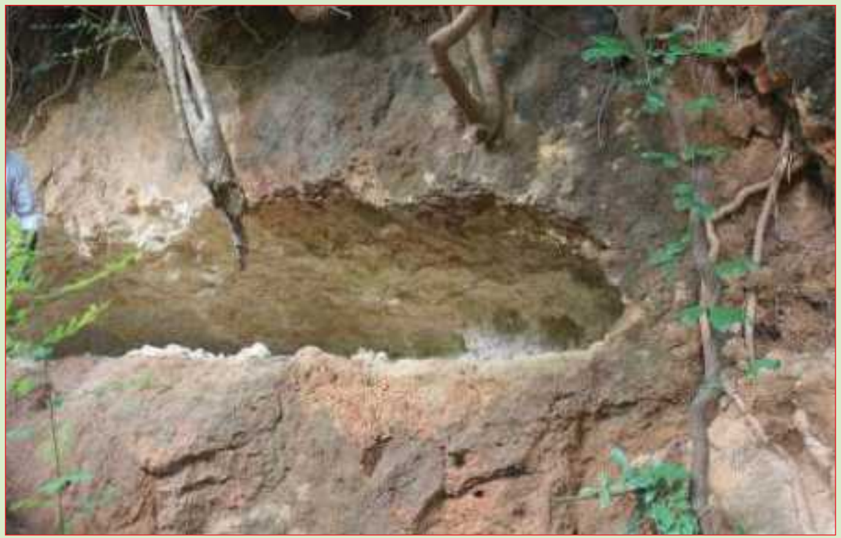
Volcanic Ash (3m x 5m) occuring at Murreru River, a tributary of Kinnerasani River, near Gangaram Village, Kothagudem, Khammam District, Telangana State.